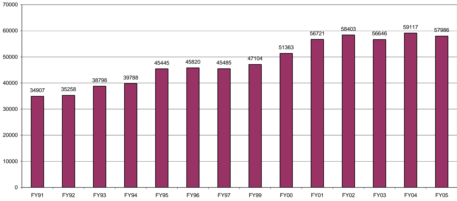
Clients Served by Domestic Violence Programs FY91 to FY05 (*FY98 data is not accurate due to change in data collection systems mid-year)